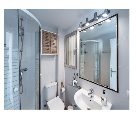
Ref.-ID: R4967785 Fuengirola

Community: 2,148 EUR / year IBI: 737 EUR / year