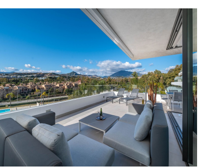
Ref.-ID: R4969435 Community: 4,800 EUR / year