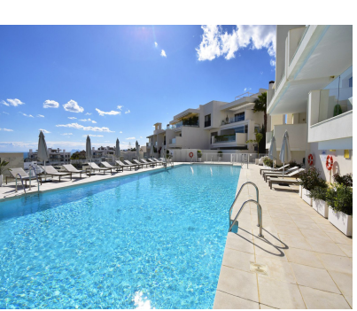
Ref.-ID: R4973656 Community: 3,492 EUR / year