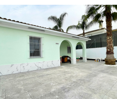
Ref.-ID: R4980703 Coín

Community: 396 EUR / year IBI: 840 EUR / year