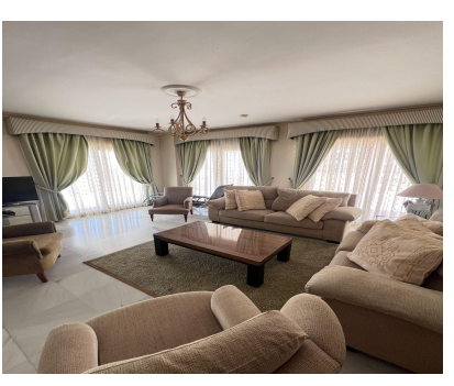
Ref.-ID: R4982674 Fuengirola Apartment