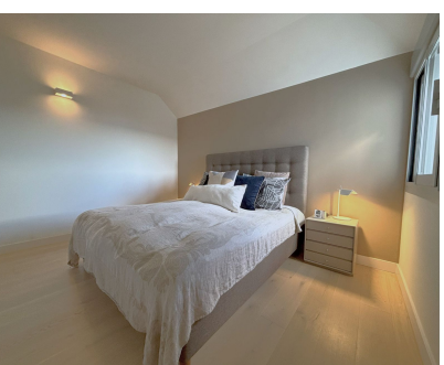
Ref.-ID: R4989673 Fuengirola Apartment