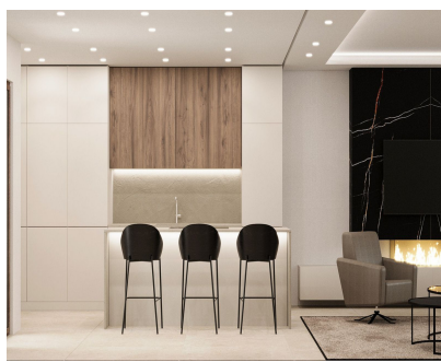
New Golden Mile Ref.-ID: R5002918 House