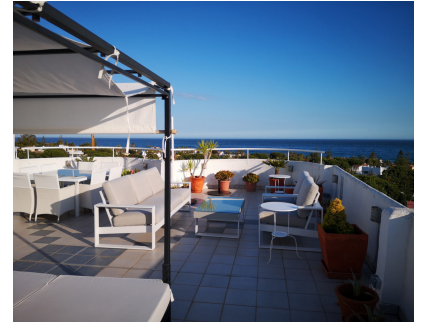
Ref.-ID: R1967499 Marbesa