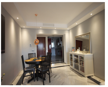
Ref.-ID: R3470596 Nueva Andalucía Apartment