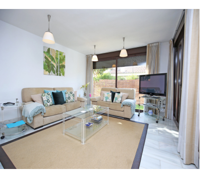
Ref.-ID: R3728872 Marbella