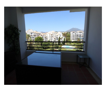
Puerto Banús Ref.-ID: R4112719 Apartment