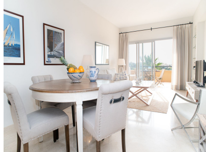
Ref.-ID: R4293436 Elviria Apartment