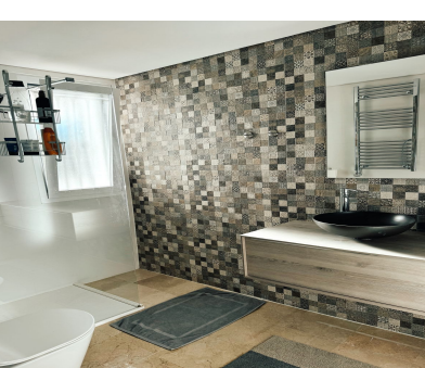
Ref.-ID: R4409398 La Quinta Apartment