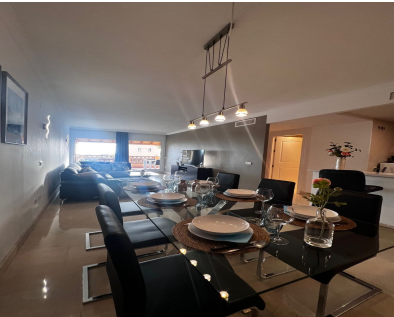
Ref.-ID: R4599607 Elviria Apartment