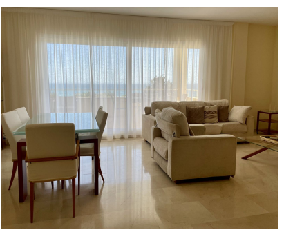
Ref.-ID: R4659190 Cabopino Apartment