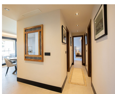
Ref.-ID: R4713670 Marbella Apartment