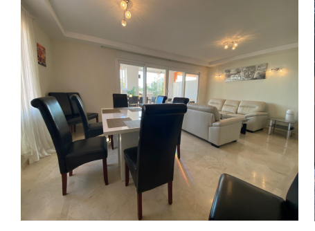
Cabopino Ref.-ID: R4874485