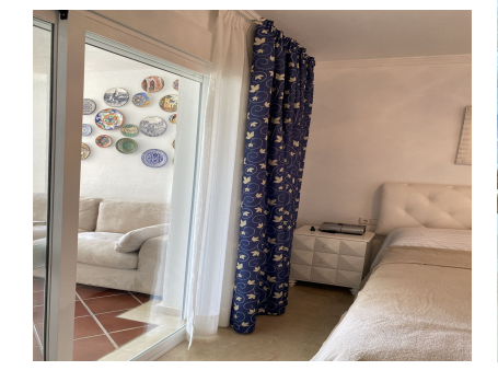
Puerto Banús Apartment