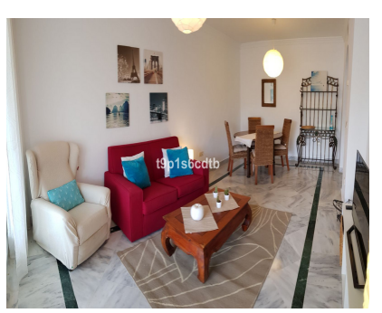
Ref.-ID: R2744681 Nueva Andalucía Apartment