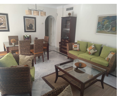
Marbella Apartment Ref.-ID: R4399669