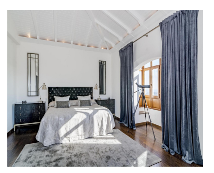
Ref.-ID: R4955842 Benahavís House