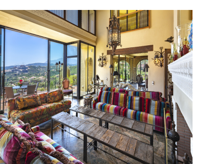
Ref.-ID: R3805369 Benahavís

Community: 3,312 EUR / year IBI: 4,941 EUR / year