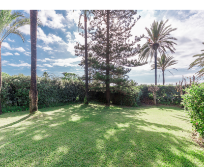
Ref.-ID: R3855409 Los Monteros House

Community: 1,080 EUR / year IBI: 4,753 EUR / year