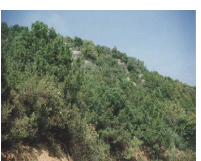
Ref.-ID: R3969556 Estepona Plot