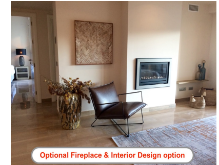
Optional Fireplace & Interior Design option