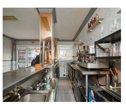
Ref.-ID: R4268800 Mijas Commercial