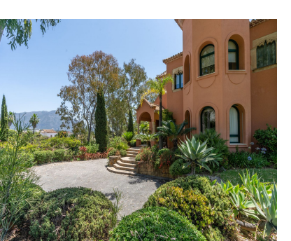
Ref.-ID: R4281043 La Quinta House

Community: 5,496 EUR / year IBI: 3,085 EUR / year