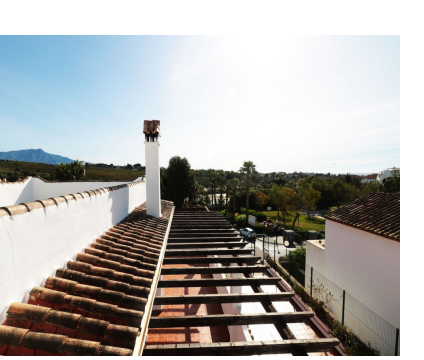
Ref.-ID: R4296241 Bel Air