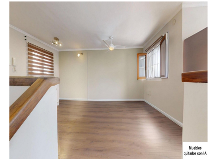
Muebles quitados con IA