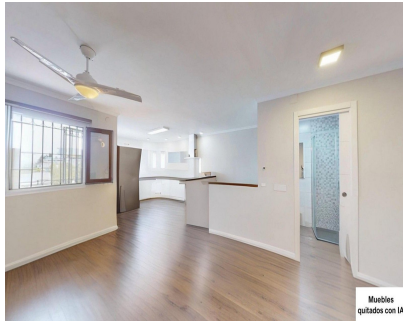
Muebles quitados con IA

www.arbatstates.com +34 606 84 36 45 +34 602 51 80 97 info@arbatstates.com