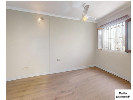
Muebles quitados con IA