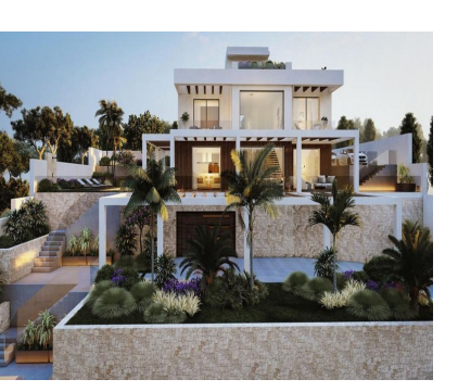
Ref.-ID: R4346713 Elviria Plot