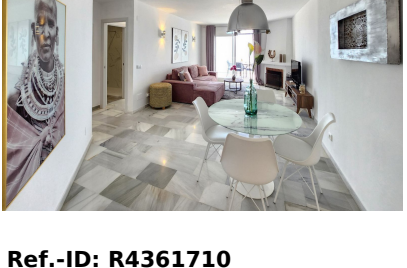
Community: 1,920 EUR / year