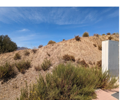
Ref.-ID: R4428838 Mijas Golf Plot