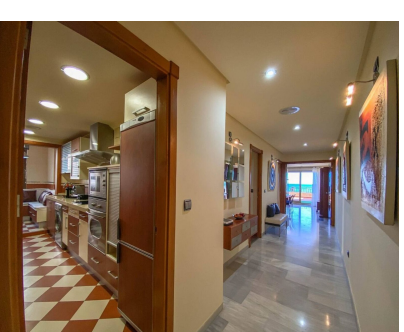
Ref.-ID: R4434787 Fuengirola