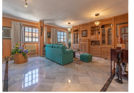
Community: 1,152 EUR / year