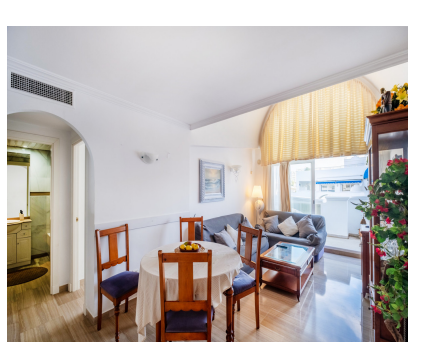
Ref.-ID: R4552396 Benalmadena Costa