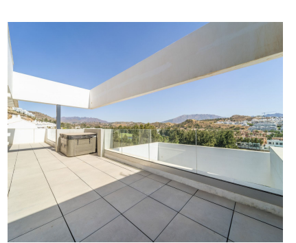
La Cala de Mijas