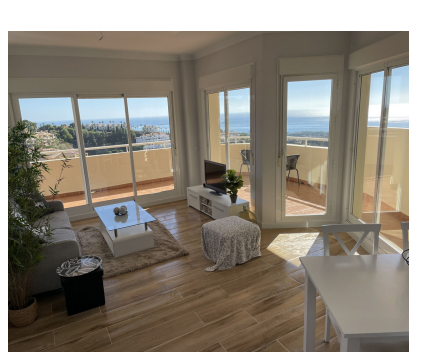
Ref.-ID: R4559635 Calahonda