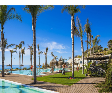
Ref.-ID: R4588909 Mijas Costa