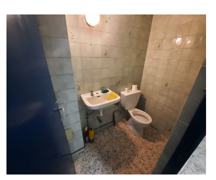
Ref.-ID: R4599160 Fuengirola Commercial