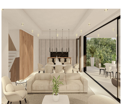
Ref.-ID: R4605820 The Golden Mile