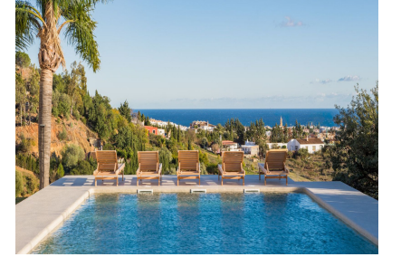
Ref.-ID: R4606189 Estepona