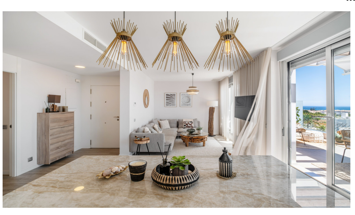
IBI: 514 EUR / year