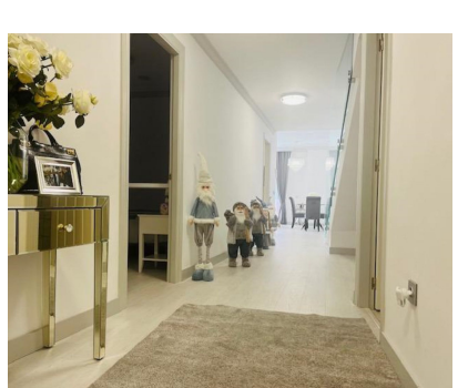
Ref.-ID: R4632856 Estepona