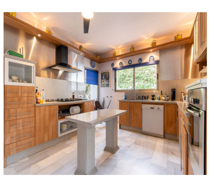
Ref.-ID: R4643179 Fuengirola