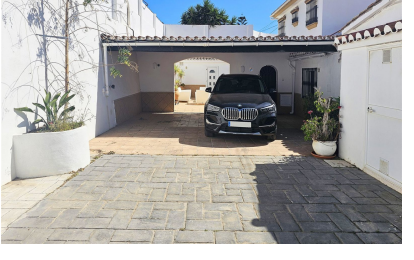
IBI: 1,231 EUR / year