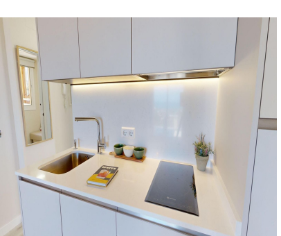
Ref.-ID: R4662202 Calahonda