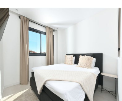
Ref.-ID: R4670323 Fuengirola

Community: 3,324 EUR / year IBI: 700 EUR / y