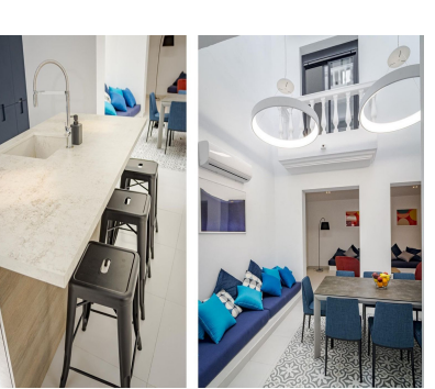
Ref.-ID: R4677892 Estepona House