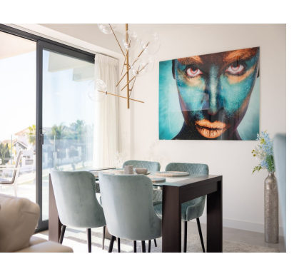
Ref.-ID: R4681270 Estepona