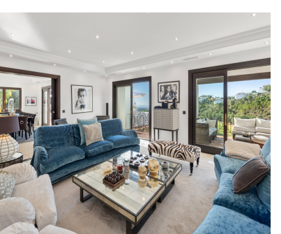
Ref.-ID: R4700413 Benahavís House